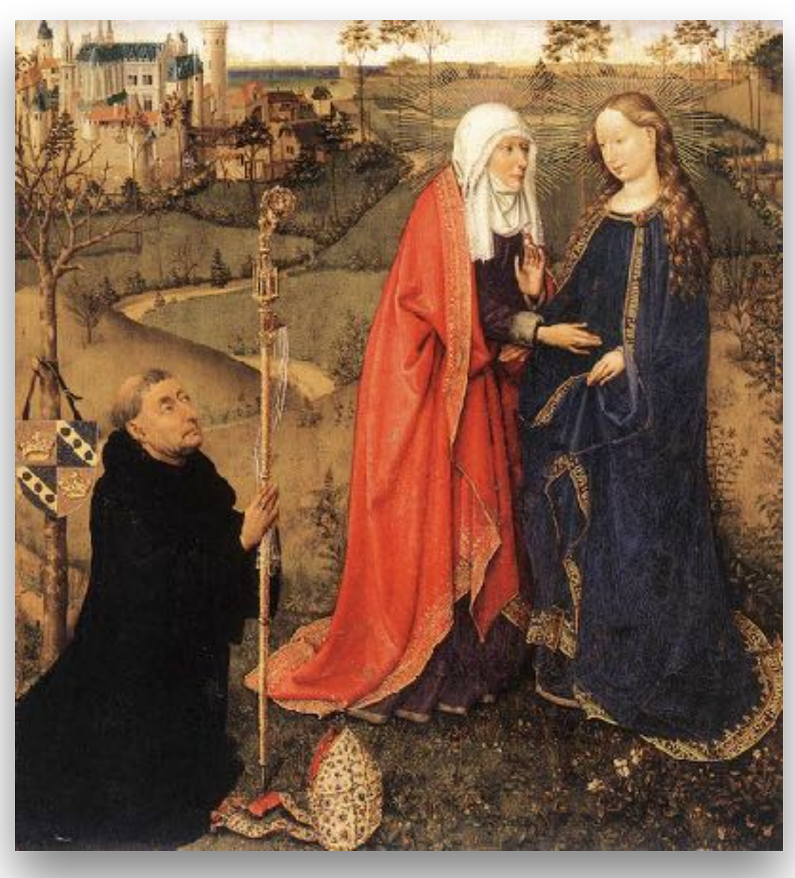
The Visitation Altarpiece by Jaques Daret