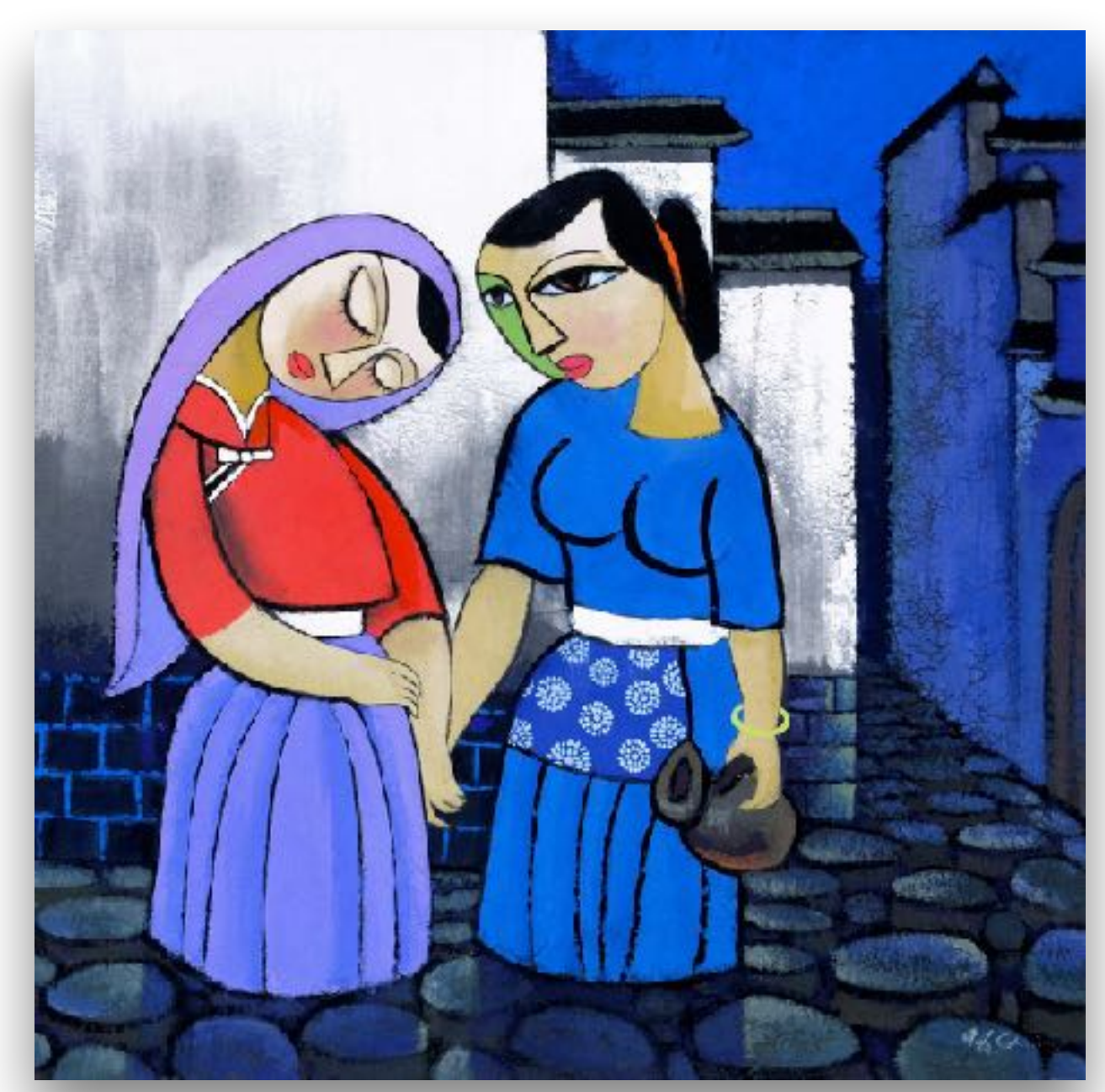
The Visitation by He Qi