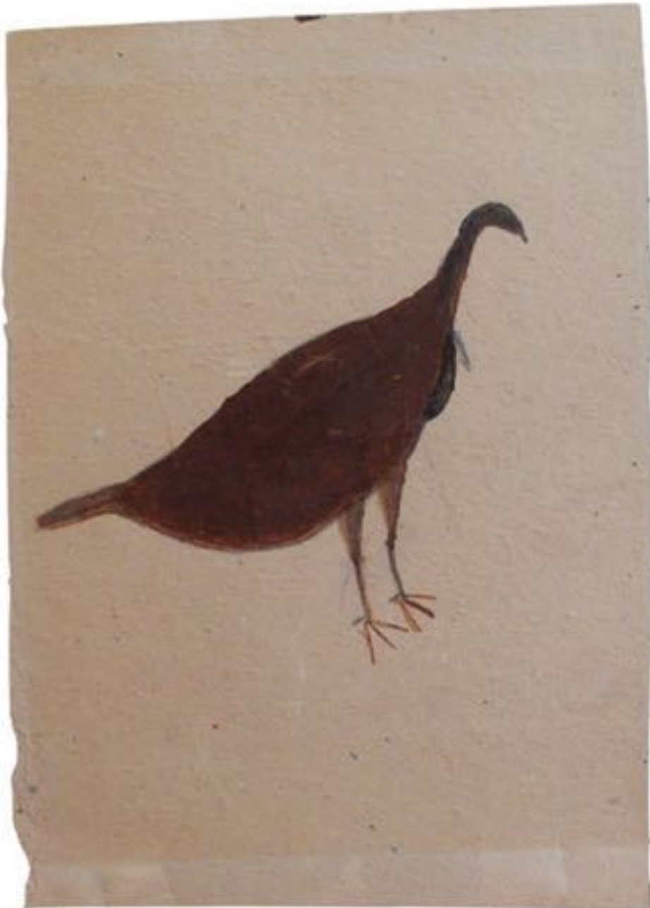
Bill Traylor, Untitled (Brown Turkey)