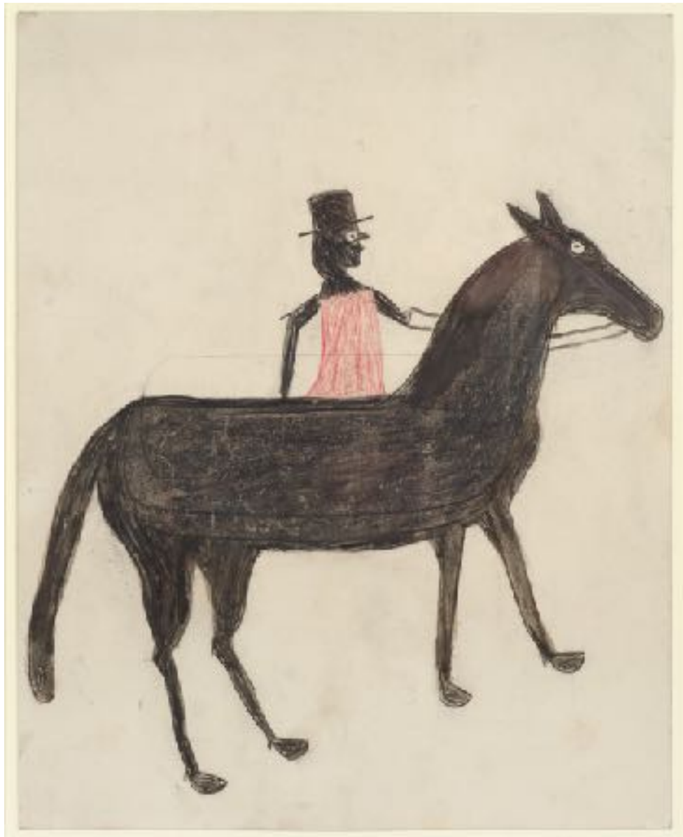
Bill Traylor, Black Horse, Red Rider, 1939-1942