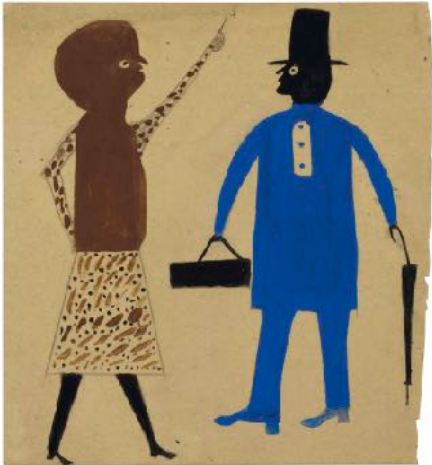
Bill Traylor, Two works