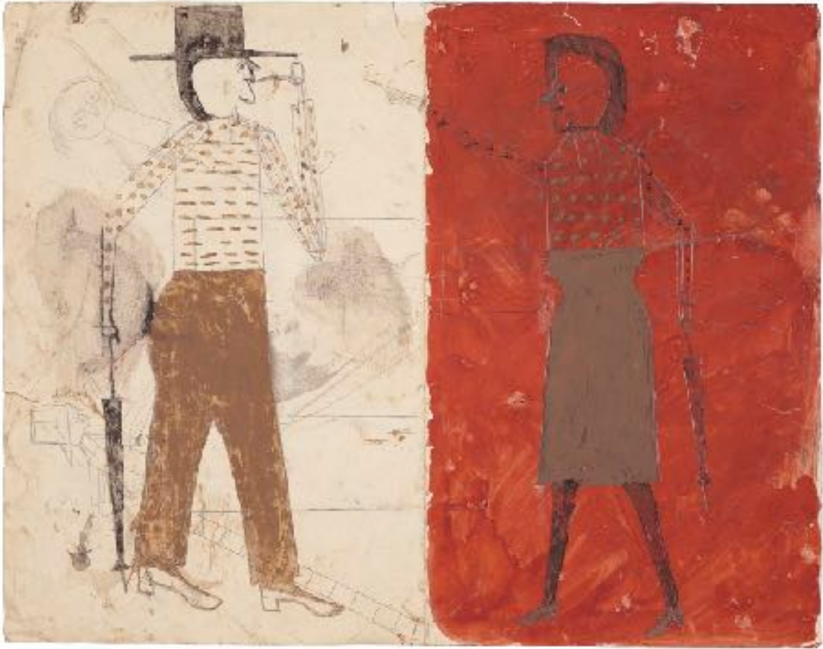
Bill Traylor, "Man on White, Woman on Red"