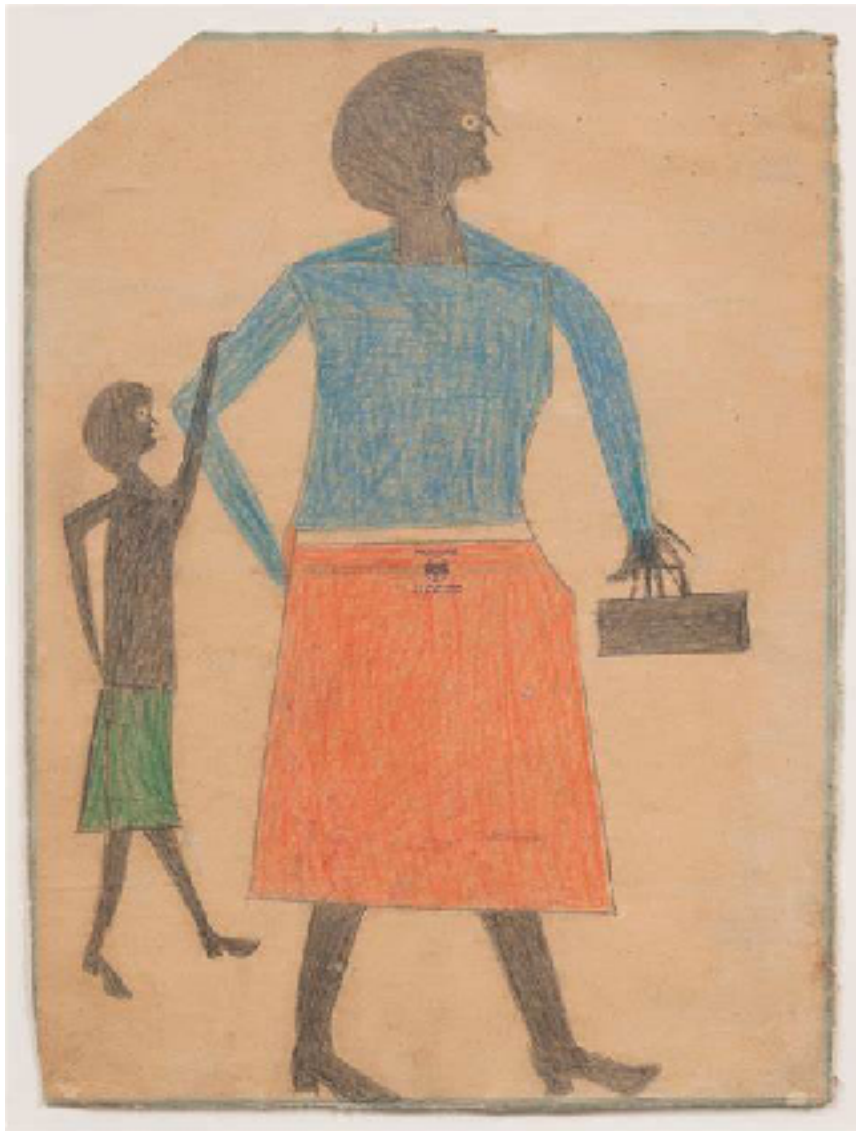
Bill Traylor, Untitled

OR FEEL FREE TO DROP IT IN THE MAIL TO 1216 CAVE ST, LA JOLLA, CA 92037 . YES, WE WILL STILL CHECK THE MAIL!