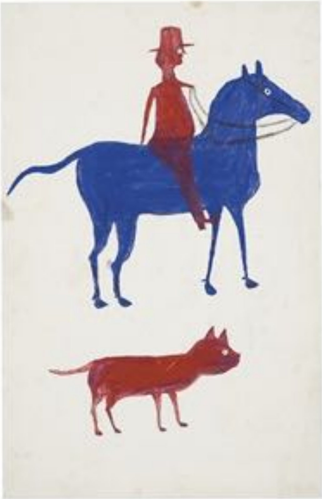
Bill Traylor, Man on Blue Horse with Dog