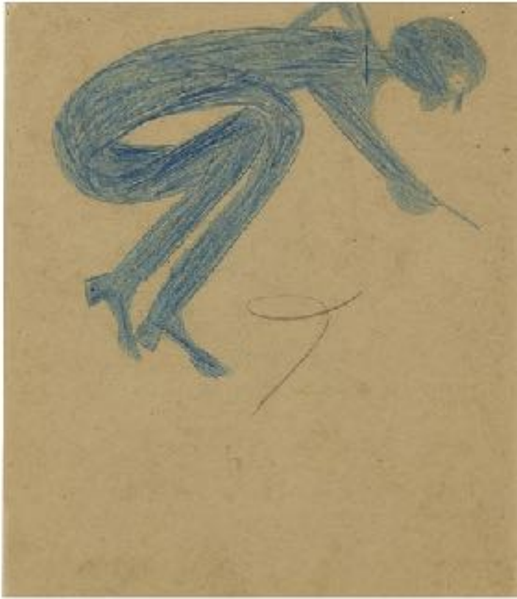
Bill Traylor, Crouching Man Pointing