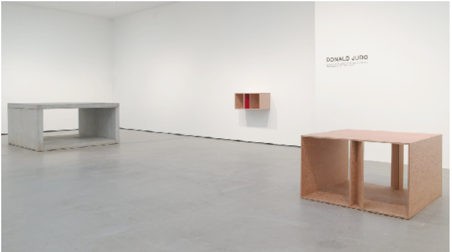
Donald Judd artworks as displayed in Pace Gallery