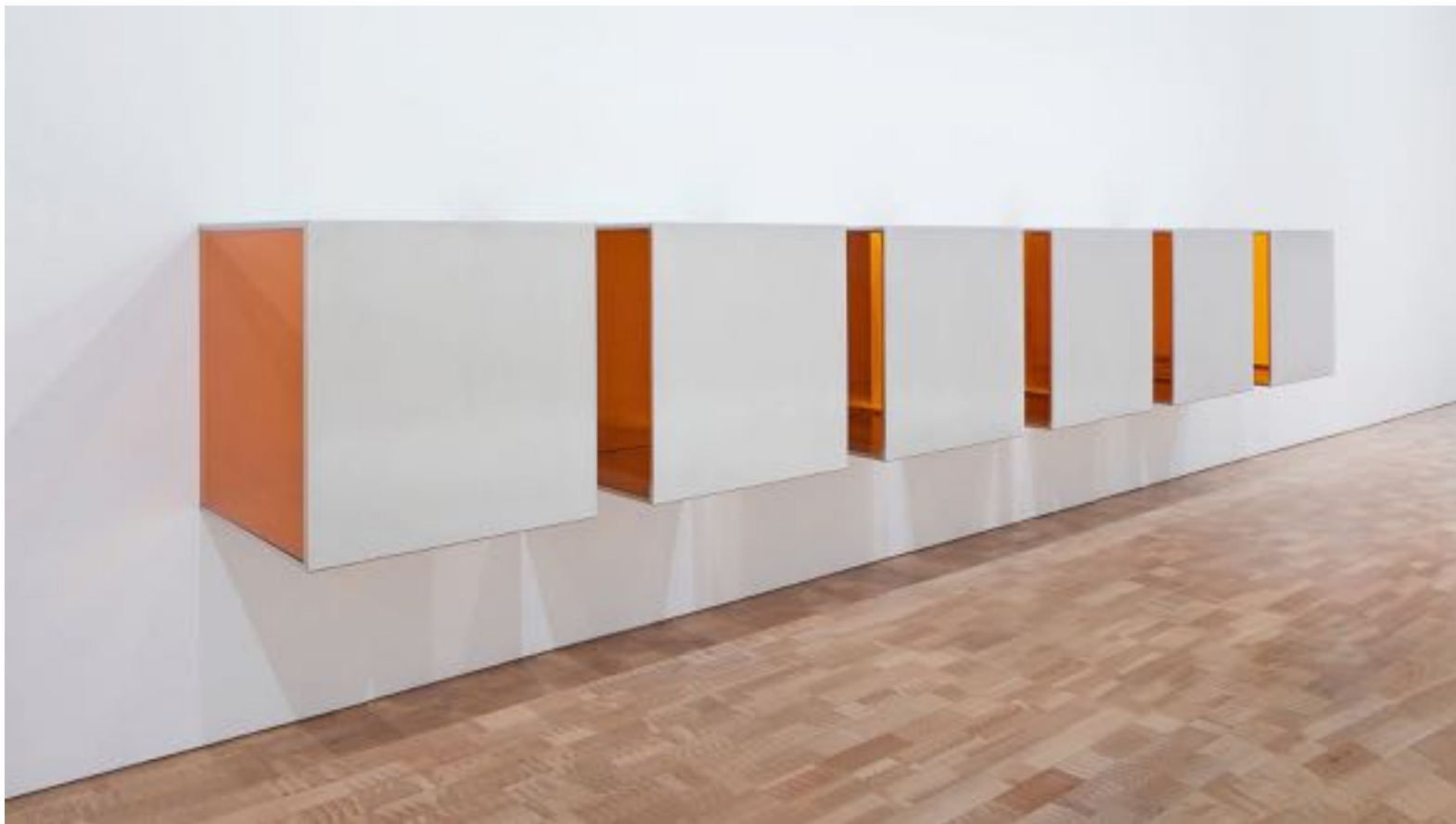
Donald Judd, Untitled, 1966/68