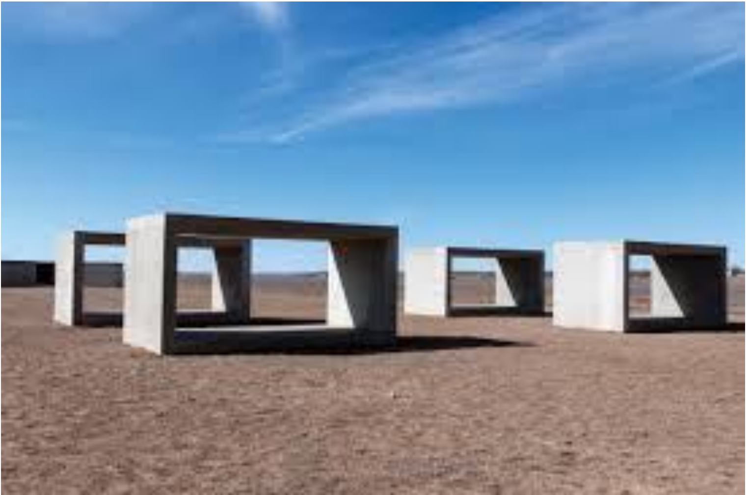
Donald Judd, "Untitled" Marfa, Texas