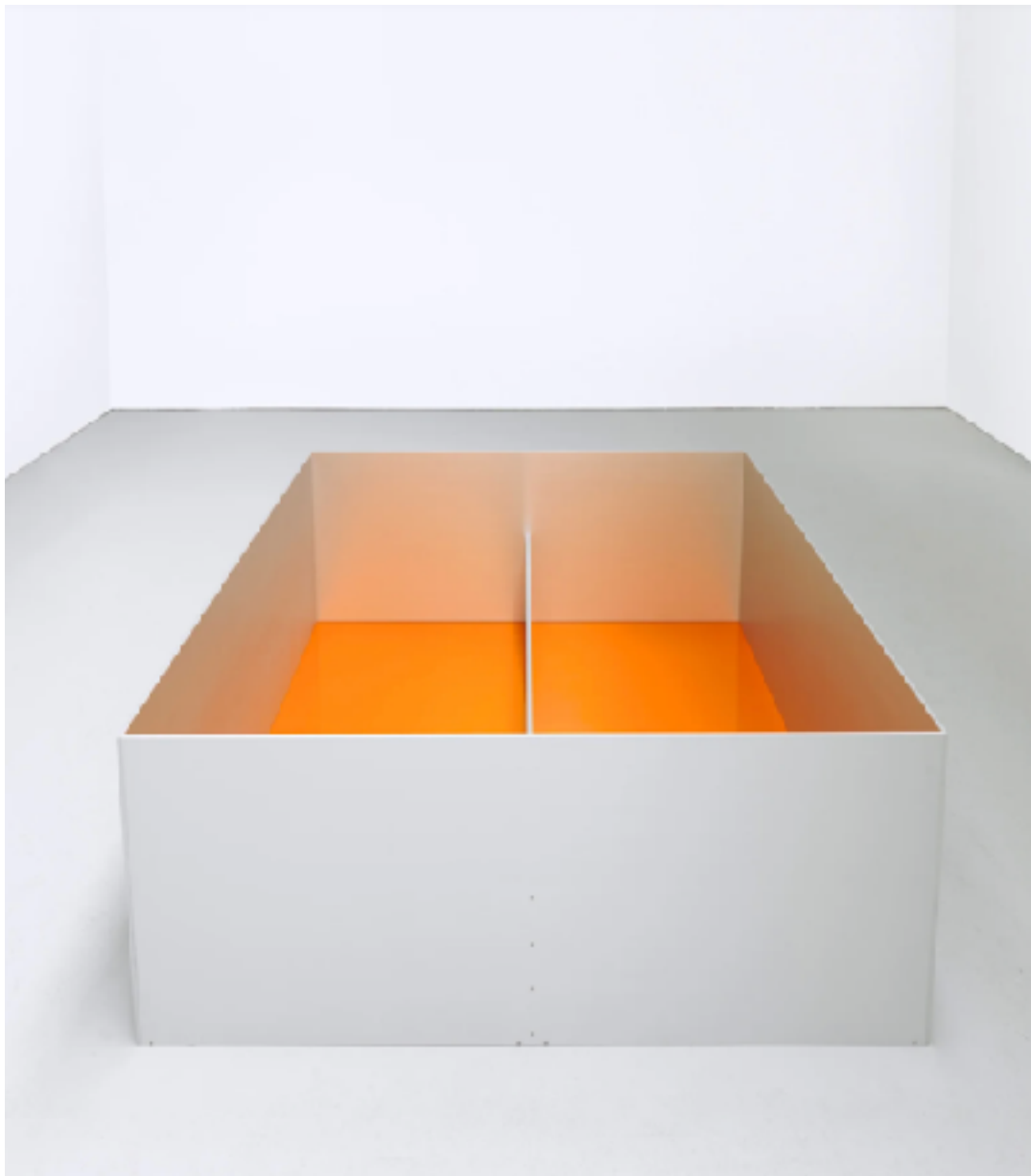
Donald Judd, "Untitled," 1989

PLEASE CLICK ON THE AUDIO FILE MARKED "AUDIO FILE 4" IN THE EMAIL TO ENJOY NINA'S PIANO SOLO.