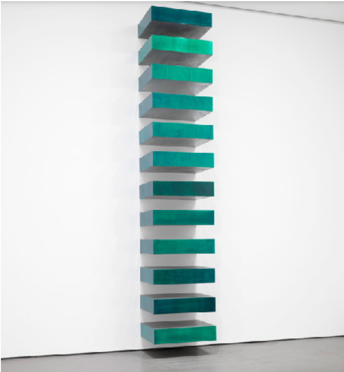
Donald Judd, "Untitled," 1967

DURING THIS TIME LEAVE YOUR FEARS, DOUBTS, AND UNCERTAINTIES OUTSIDE THE ROOM AND BE COMPLETELY PRESENT WITH YOURSELF. BREATHE INTENTIONALLY AND FOCUS ON EACH INHALE AND EXHALE