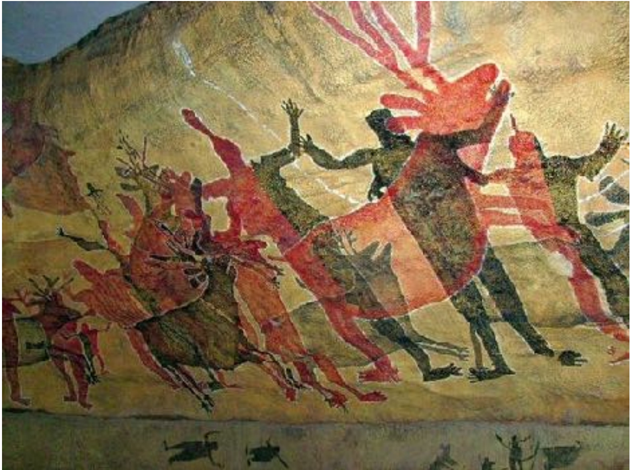
Cave painting from San Ignacio, Baja California Sur