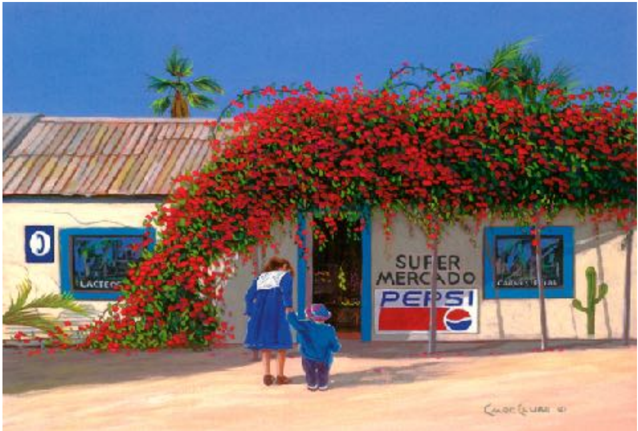
Paintings from a Cabo San Lucas Gallery