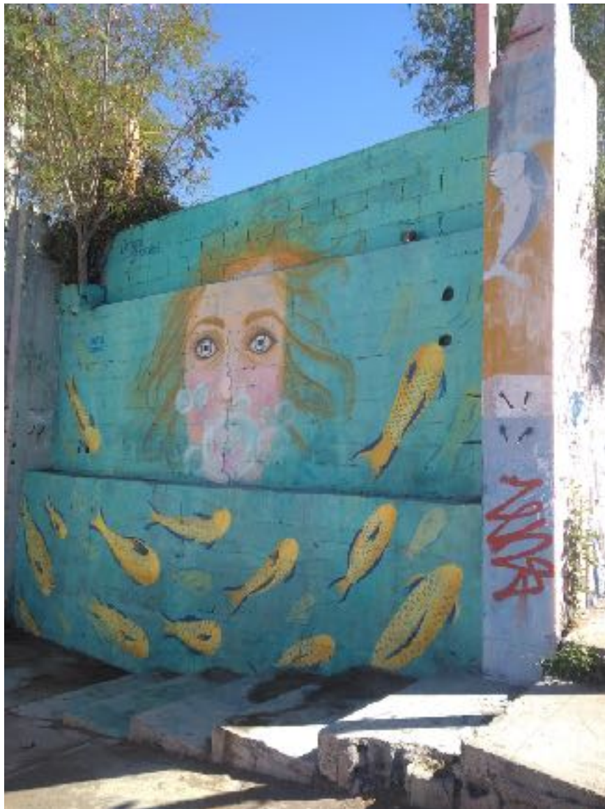
Street art in La Paz, Baja California Sur