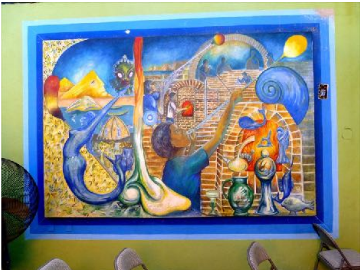
Mural depicting glass blowing at the Vitrofusion Glass Blowing Factory in Cabo San Lucas, Baja California Sur