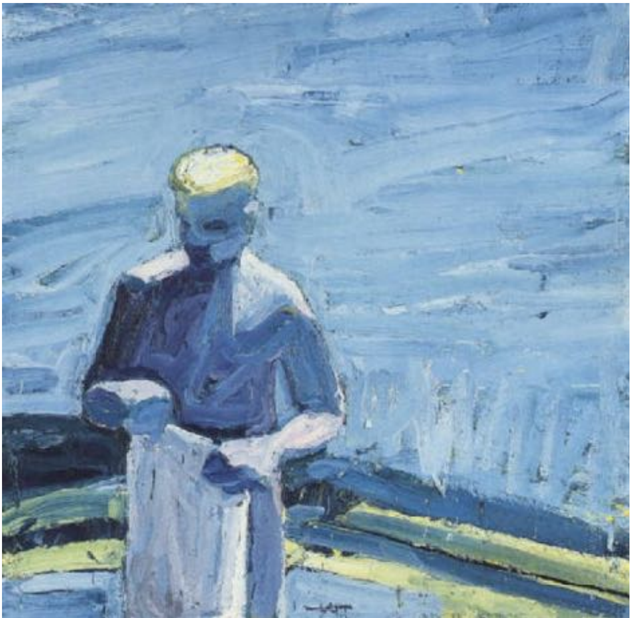
Paul Wonner, Untitled