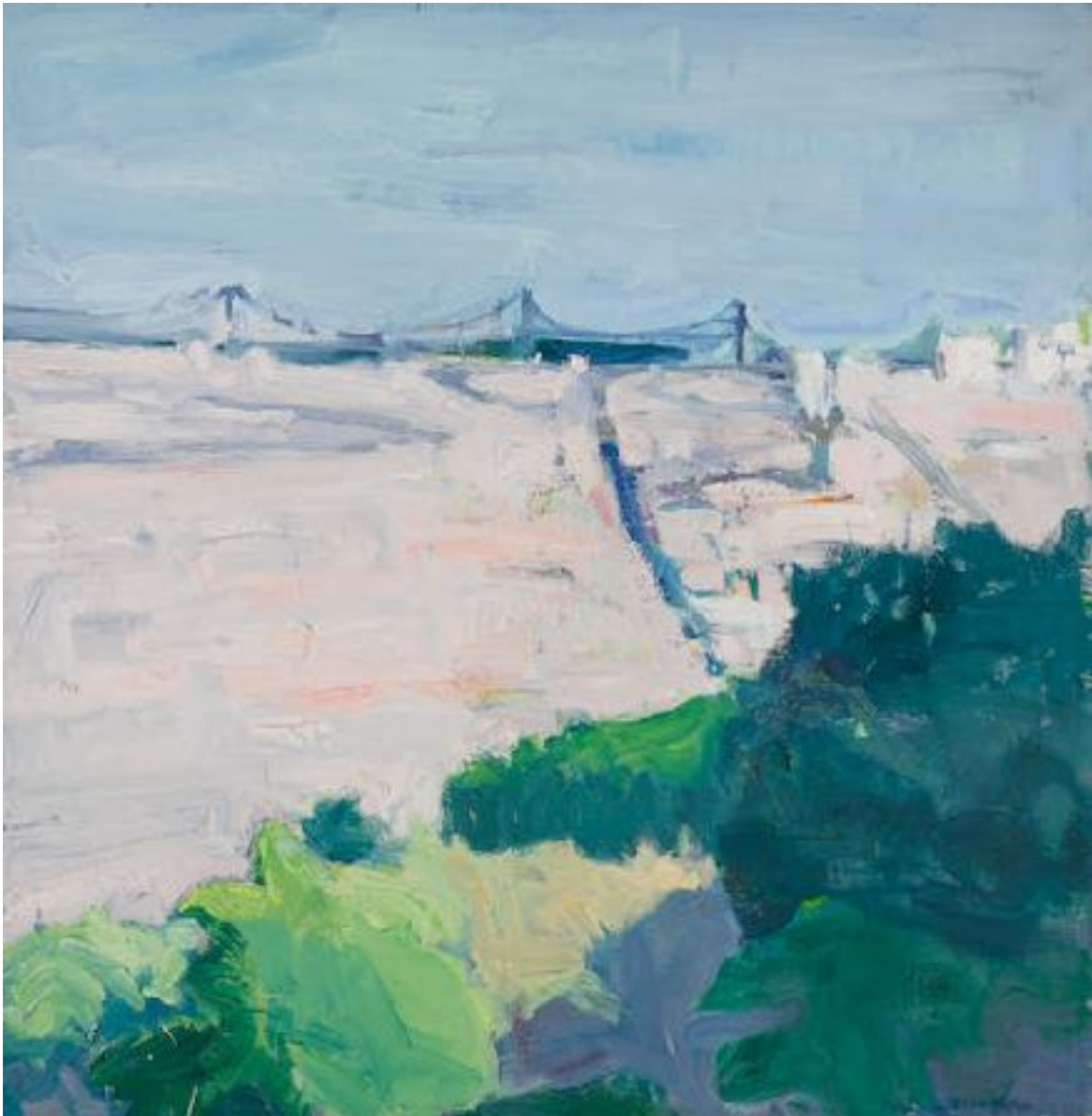
Paul Wonner, View from Russian Hill in San Francisco, CA

JOIN US NEXT WEEK AS WE JOURNEY FROM SAN FRANCISCO TO LOS ANGELES WE WILL CONTINUE TO WORK OUR WAY THROUGH CALIFORNIA