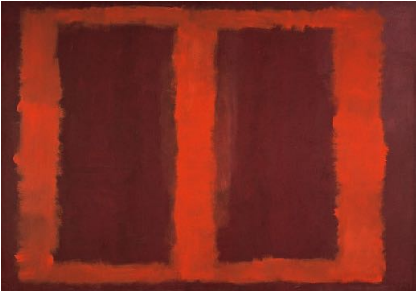
Mark Rothko, No. 36