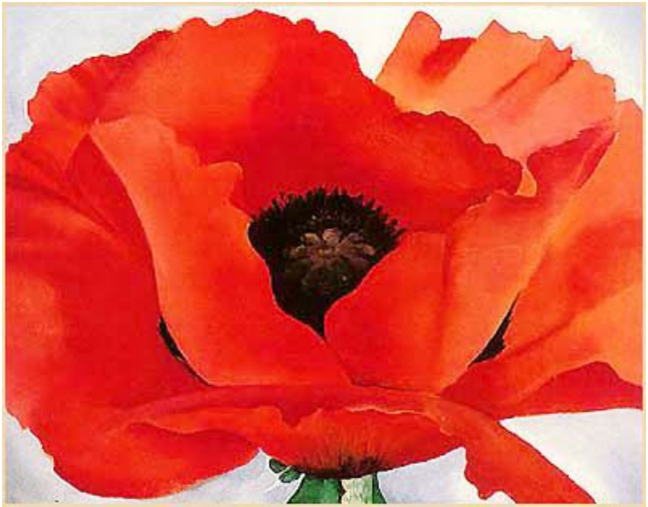
Georgia O'Keeffe, Red Poppy, 1927