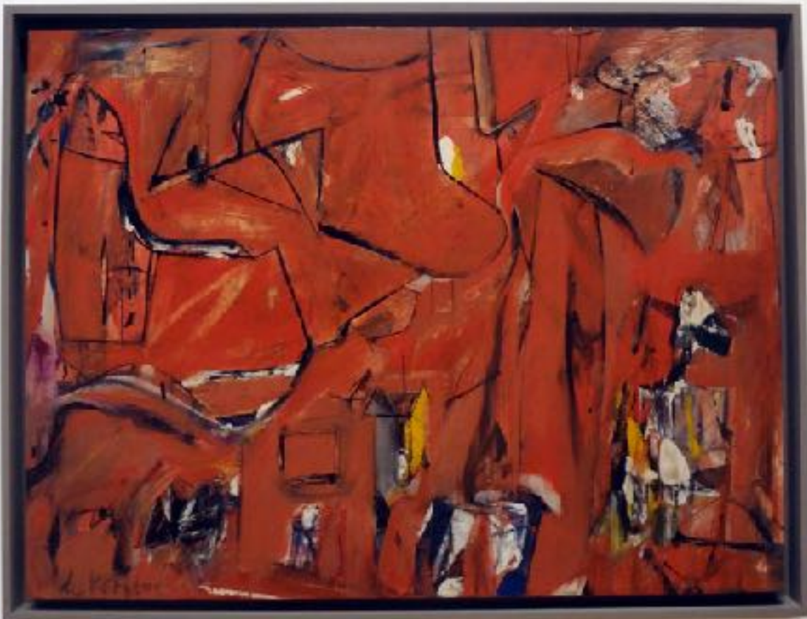
Willem de Kooning, Gansevoort Street

ENJOY BRON'S SOLO BY CLICKING ON THE AUDIO FILE MARKED "AUDIO FILE 2" IN THE EMAIL.