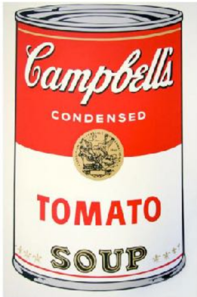
Andy Warhol, Soup Can