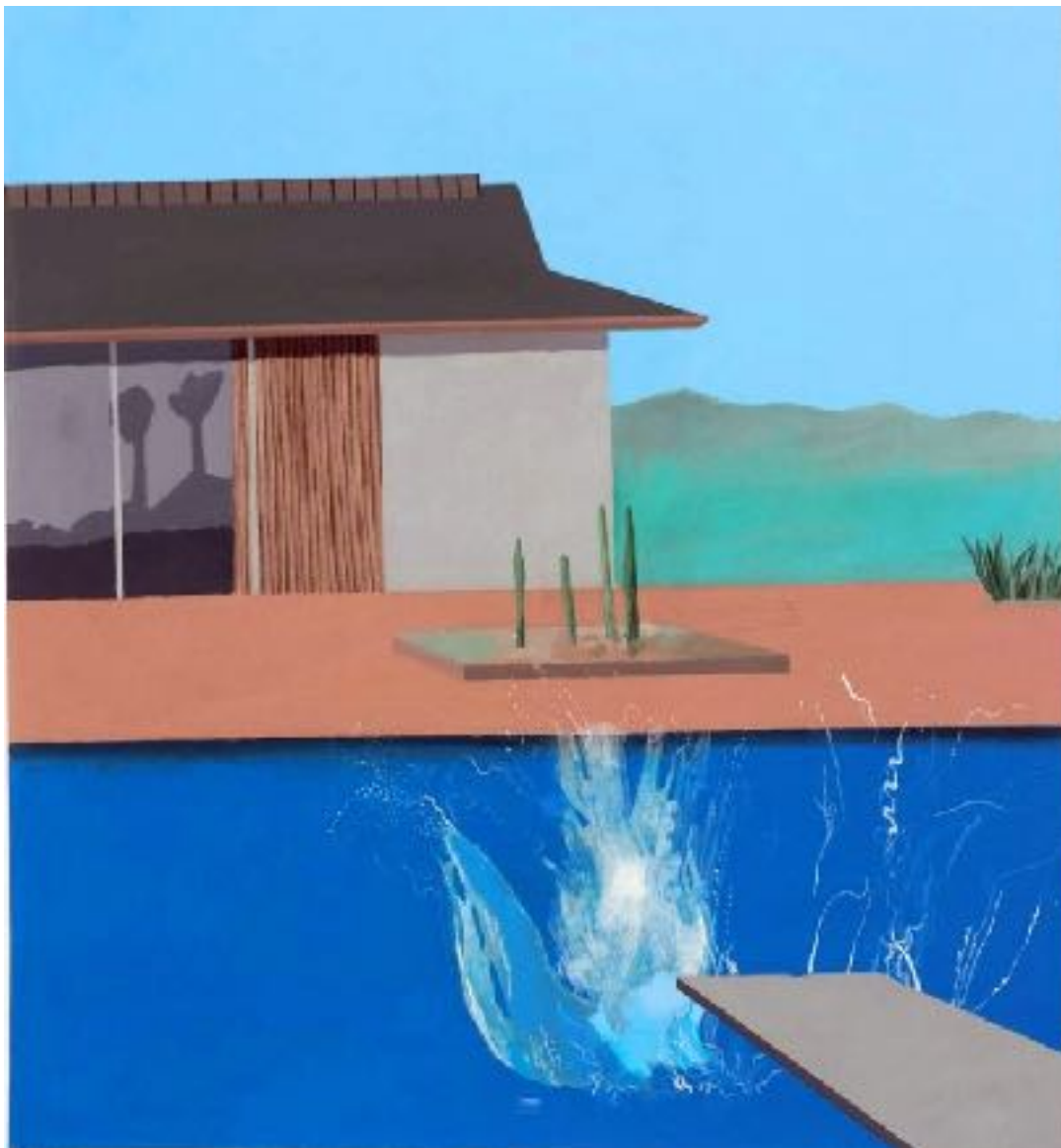
David Hockney, The Splash