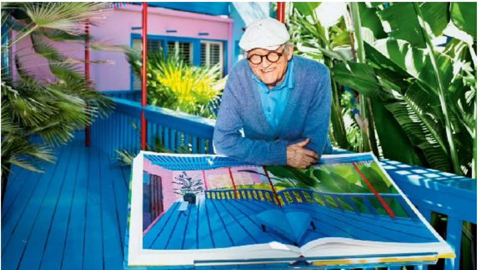
David Hockney in 2018

YES, EVEN THOUGH WE AREN'T TOGETHER THE WORK OF THE CHURCH CONTINUES. WE MIGHT NOT BE PASSING A LITERAL OFFERING PLATE BUT WE ARE PASSING A VIRTUAL ONE. YOUR GIFTS AND TITHES ARE WHAT HAVE ALLOWED THIS CHURCH TO SEE THREE DIFFERENT CENTURIES. PLEASE CONSIDER PROVIDING YOUR OFFERING THROUGH THE FOLLOWING LINK: https://www.paypal.com/cgi-bin/webscr?cmd=_s-xclick&hosted_button_id=MHKJLYNRGPDUS&source=url OR FEEL FREE TO DROP IT IN THE MAIL TO 1216 CAVE ST, LA JOLLA, CA 92037. YES, WE WILL STILL CHECK THE MAIL!